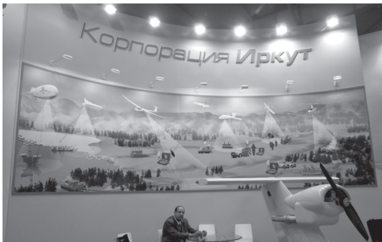
The backdrop of Irkut Corporation's booth, which was on display during the International Defense Exhibition of Land Forces this year, depicts Irkut aerial reconnaissance systems, including the Irkut-850 (the third aircraft pictured from left) linked to various ground control stations.